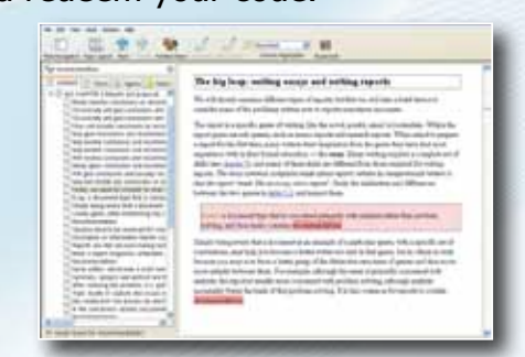
Use the search function to locate key concepts.

After the book has downloaded, click on "All Titles" in the collection pane and double click on your book to open it.